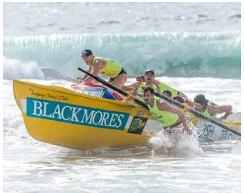
Photographer PAUL LEMLIN catches some of the Ocean Thunder action at Dee Why last Saturday. Top: The Collaroy men's crew bounced back to form and finished third in the final behind Avoca and Batemans Bay. Below left: The South Curl Curl crew made the final for the first time and finished fourth; Bottom right: The Bilgola crew.